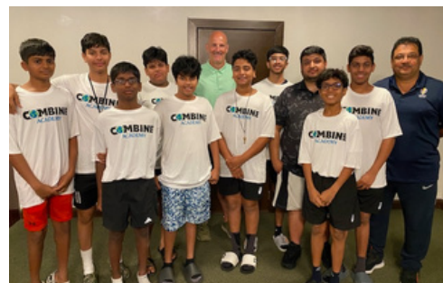
A group of 13-14 year old young men from Keystone Basketball Academy in Hyderabad, India visited Combine Academy.

Continued communication about Combine's events, achievements, newcomers, plans, etc. will be shared throughout the coming months. Look forward to a monthly newsletter this year for more information about our students and school!